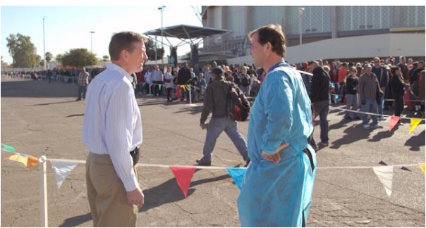
To view more photos from the Mission of Mercy event please click here.

The Arizona Dental Mission of Mercy held a free dental care clinic at the Arizona Veterans Memorial Coliseum this past weekend. Over 1,500 dentists, dental hygienists and lab technicians donated their time and expertise through the Mission of Mercy to send an important message: good health starts with oral health.