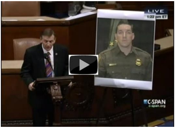
Congressman Gosar honored Agent Terry on the House floor. Please click above to watch.

The American people still deserve answers and justice. Lives were lost on both sides of the border, yet the Attorney General continues to believe he is above the law, despite being held in contempt of Congress and facing a civil lawsuit. I will also continue to push for a vote on my Resolution of No Confidence in Attorney General Holder. Please read more here.