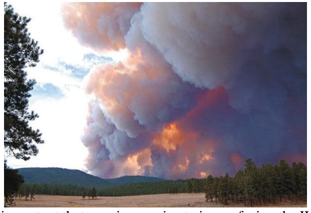
It is important that we give a voice to issues facing the West.

I am pleased to be a part of the Western Caucus leadership team. I have always said that a national understanding of the western states, our culture and our contributions to our nation's economy is key to a national recovery.