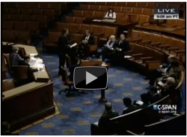
Please click above to watch Congressman Gosar speak about Tombstone's struggle.

This week, I spoke on the House floor about Tombstone's yearlong standoff with the federal government over repairs that will restore the town's water supply.