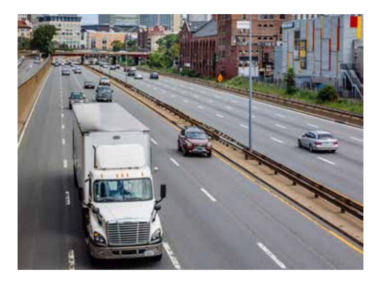
The Surface Transportation Reauthorization and Reform Act of 2015 helps address the most pressing transportation needs of our country:

Furthermore, while states must have the flexibility to address their varied and unique transportation needs, the federal surface transportation programs are able to help states build projects that they otherwise could not fund themselves, or that involve complex coordination with additional states.