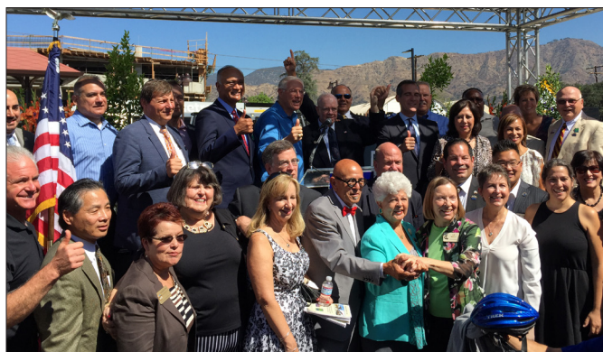
Napolitano discusses completion of Gold Line Foothill Extension with residents of Azusa on September 18. Metro service to begin March 2016 at 6 new stations—APU/Citrus College, Azusa Downtown, Duarte, Irwindale, Monrovia & Arcadia. Info: metrogoldline.org .

Info: napolitano.house.gov/sites/napolitano.house.gov/files/documents/CAaccomplishmentsFASTAct.pdf