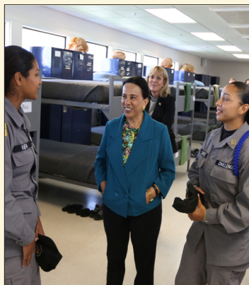
Sunburst Youth ChalleNGe Academy cadets discuss transforming experience of NGYCP.

With Co-Chair McKinley & Congressional Youth ChalleNGe Caucus, Napolitano secured $150 million for 2016, a $15 million increase, for new National Guard Youth ChalleNGe Programs (NGYCP), which enhance education levels, life skills, and employment potential of 16-18 year old youth at risk.