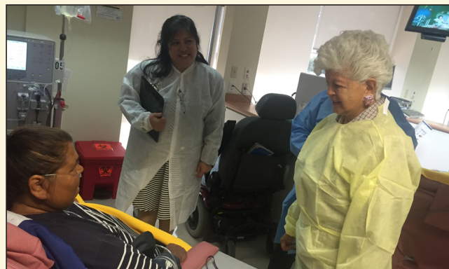
Rep. Napolitano discusses medical issues with a patient at West Covina Kidney Care Dialysis Center in October.