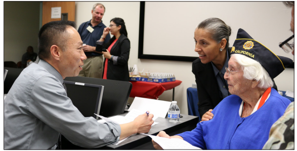
VA representatives discuss claims with Veterans at forum in July.