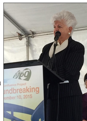
Rep. Napolitano discusses transportation safety issues in City of Industry on November 10.