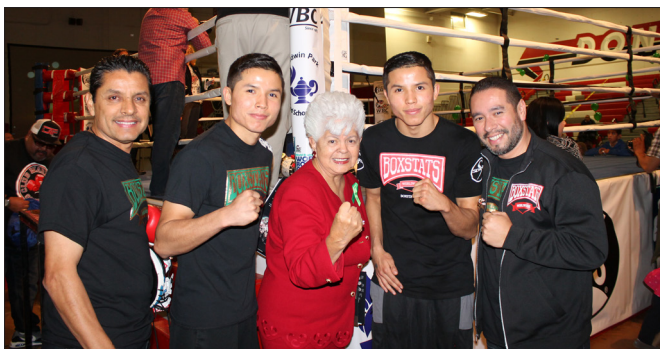
Napolitano, Chair of the Mental Health Caucus, discusses mental health legislation and stigma reduction with young boxers who encouraged Sierra Vista students to always ask for help.