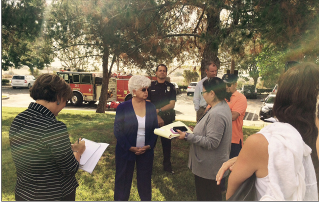
Rep. Napolitano discusses safety and homelessness issues with LA County officials near Azusa on August 25.

Azusa Police Department and the City of Duarte asked Congresswoman Napolitano for assistance with concerns that homeless encampments along the 605/San Gabriel Riverbed on Army Corps of Engineers (Corps) property were fire potentials and in danger of being