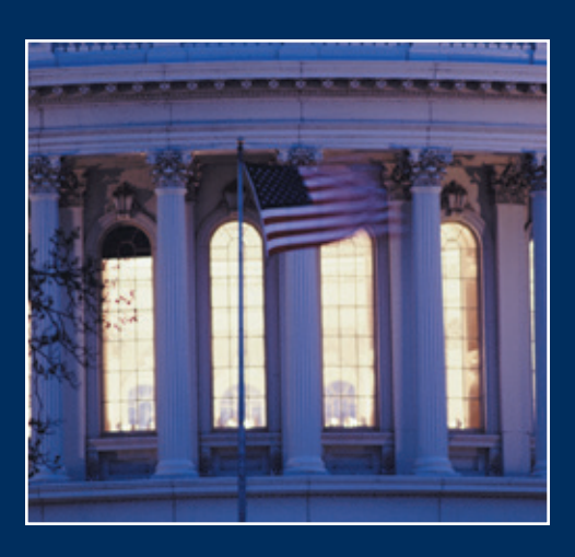
on the UNITED STATES GOVERNMENT