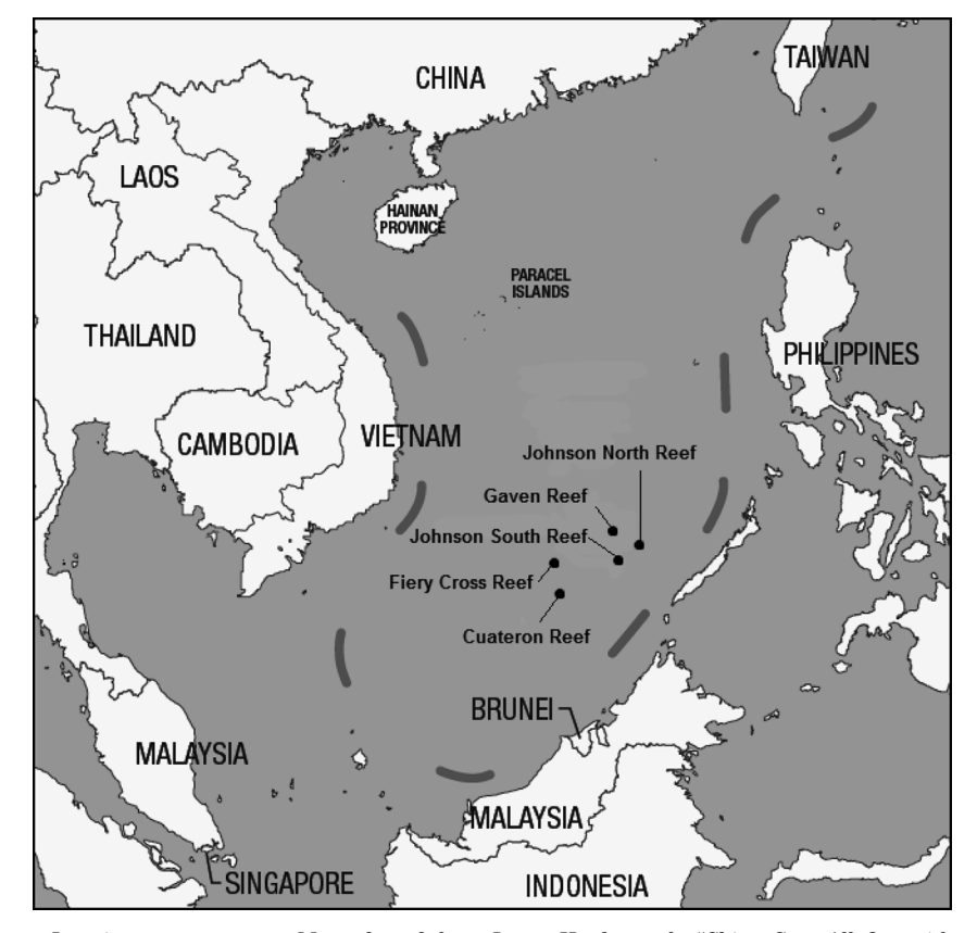
Figure 4: China's Major Land Reclamation Projects in the South China Sea

Locations are not exact. Map adapted from James Hardy et al., "China Goes All Out with Major Island Building Project in Spratlys," IHS\ Jane's\ 360 , June 20, 2014. http://www.janes.com/article/39716/china-goes-all-out-with-major-island-building-project-in-spratlys.