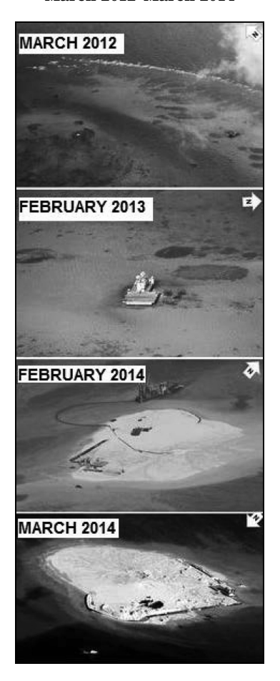
Figure 5: China's Land Reclamation Activities at Johnson South Reef, March 2012–March 2014

Photographs of China's land reclamation activities on Johnson South Reef, from top to bottom, taken in March 2012, February 2013, February 2014, and March 2014. Image adapted from Pia Lee-Brago, "Photos Reveal Stages of China Reclamation at Reef," Philippine Star , May 16, 2014. http://www.philstar.com/headlines/2014/05/16/1323659/photos-reveal-stages-china-reclamation-reef.