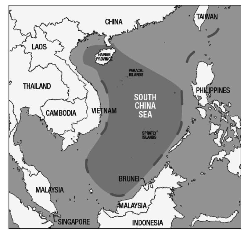
Figure 6: Hainan Province's Claimed Maritime Jurisdiction

Although the new measures do not appear to set forth new policy, subtle linguistic differences from previous iterations of the regulations suggest Hainan is taking a more pronounced stance regarding perceived foreign infringements on China's "maritime rights and interests." <sup>96</sup> Whether Hainan's new regulations are the result of directives from the central government is unclear, but given the regulations' politically sensitive nature and implications for China's relationships with its neighbors, Beijing likely had a role in shaping the new measures.