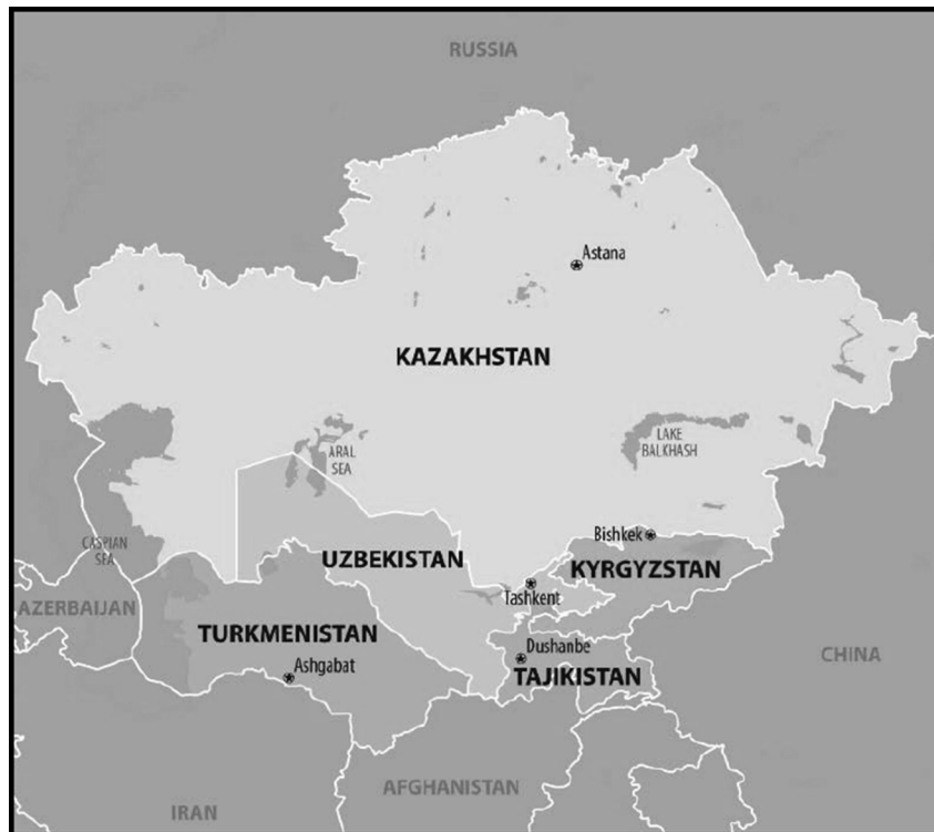
Figure 1: Map of Central Asia

Decades before the Silk Road Economic Belt was announced, China approached relations with Central Asia with a clear set of interrelated objectives: (1) encouraging economic engagement between Central Asia and China's westernmost province, Xinjiang, to bolster development and stability in that province; 3 (2) eradicating what it calls the "three evils" of extremism, separatism, and terrorism from the region and preventing them from taking root in Xinjiang; 4 and (3) expanding China's economic and geostrategic in-