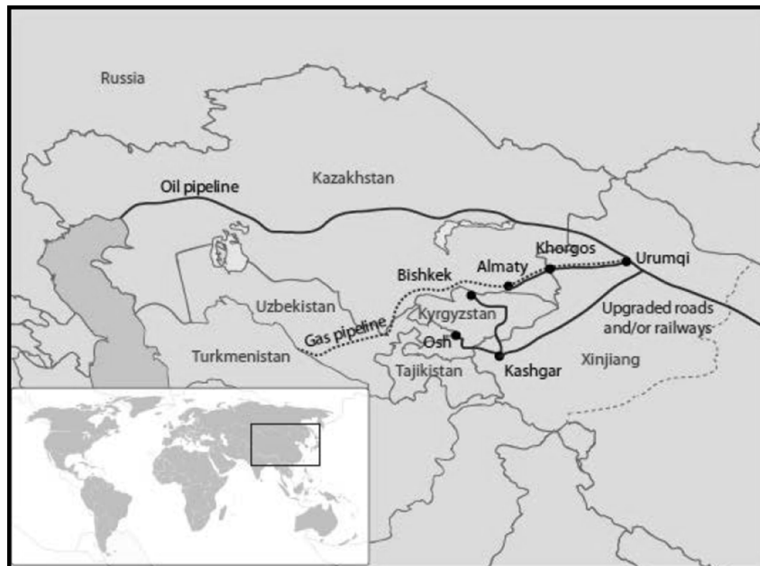
Figure 4: Oil and Natural Gas Pipelines from Central Asia to China

Source: Tom Miller, "Travels along the New Silk Road: The Economics of Power," Gavekal Dragonomics , October 24, 2014.