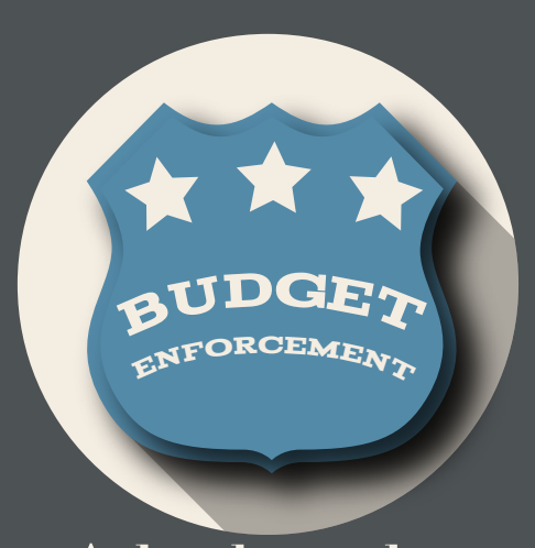
A budget that is not enforced is a budget that is not effective.