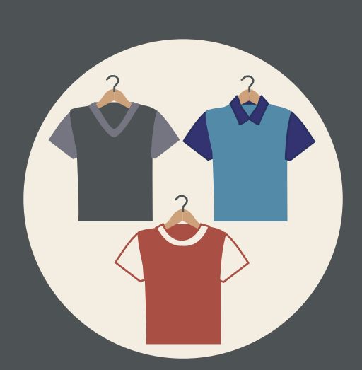
Examining the different styles of budgeting.