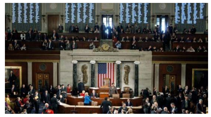
The House gallery reserved for members of the press is located behind the Speaker's rostrum and just in front of the voting board.

Each chamber of Congress has a public seating area called a "gallery" that overlooks each chamber. Both galleries have separate seating sections for the public, members of the press and media, staff, and family members. When Congress is in session, people in the gallery must remain silent as members of Congress vote or debate the day's legislative business.