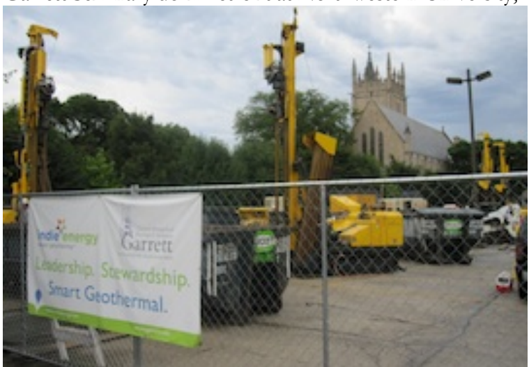
Casa Maravilla affordable housing development, Chicago, IL