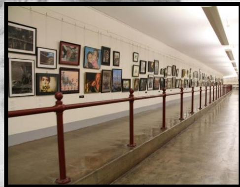
Winning art displayed in the U.S. Capitol Building.

See the next page for details about the competition and a complete list of awards, or visit our website at: Guthrie.house.gov/congressional-art-competition1