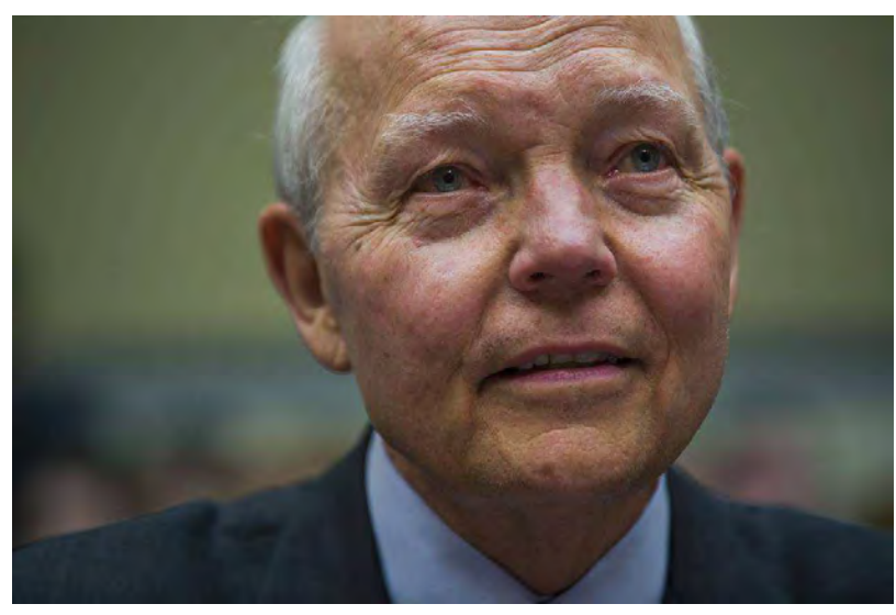
John Koskinen before the House Oversight and Government Reform Committee in Washington, D.C. on June 23, 2014.

Koskinen and the IRS deserve rebuke, but not if it costs the Senate.