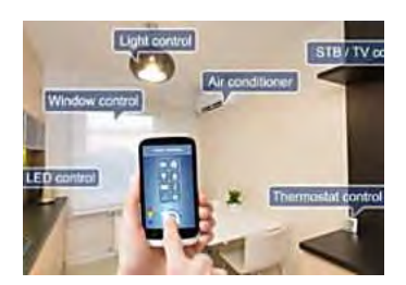
The Smart Home Features That Are Really Taking Off Promoted by Realtor.com