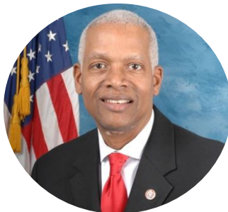
Rep. Hank Johnson (GA-04)