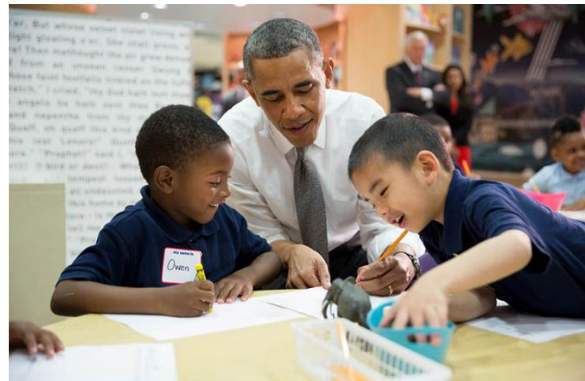
President Barack Obama participates in a literacy lesson with children while visiting a pre-kindergarten classroom at Moravia Elementary School in Baltimore, Md., May 17, 2013.

Government has a crucial role to play in closing this gap, which is why the CBC applauds President Obama's Computer Science for All initiative (CSA) , which aims to use new and existing programs to teach computer science to every student, with a particular focus on girls and students of color. The initiative is an interagency effort between the