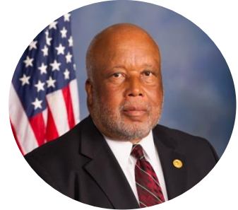
Rep. Bennie Thompson (MS-02)