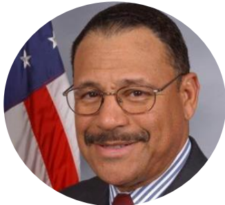
Rep. Sanford D. Bishop, Jr. (GA-02)