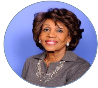
Rep. Maxine Waters (CA-43)