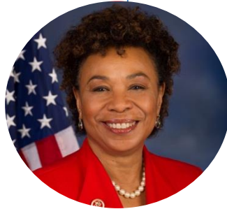
Rep. Barbara Lee (CA-13)