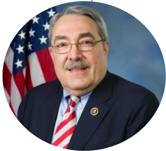
Rep. G. K. Butterfield (NC-01)