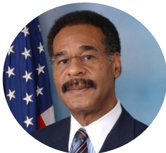
Rep. Emmanuel Cleaver, II (MO-5)