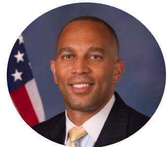
Rep. Hakeem Jeffries (NY-08)