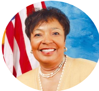
Rep. Eddie B. Johnson (TX-30)