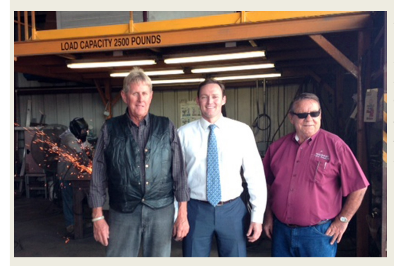
Rep. Murphy visits Phoenix Metal Products, Inc. to learn about manufacturing needs in Fort Pierce .

Rep. Murphy supports expanding the number of loans the Export-Import Bank can offer to U.S. exporters at no cost to taxpayers as well as modernizing and expanding our ports. He supports lowering manufacturing costs by lowering energy costs with expanded energy production and new, economical sources of power.