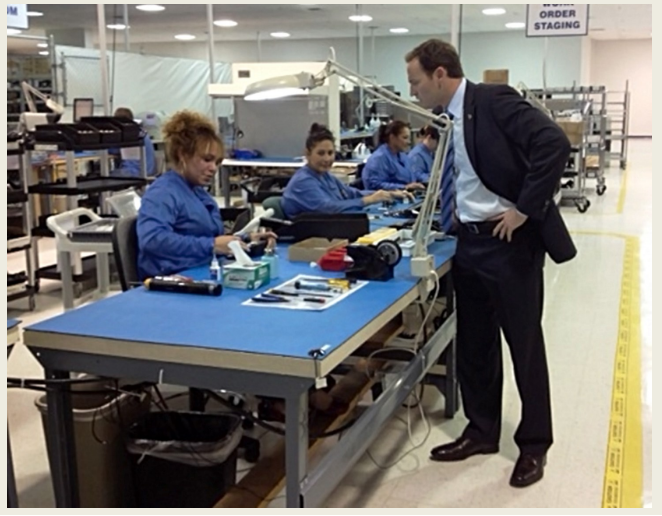
Rep. Murphy visits Cross Match Technologies in Palm Beach Gardens to hear about high-tech manufacturing developments.

• Make America energy independent – Energy independence will lower the cost of manufacturing and make it easier to export American goods. America will only achieve energy independence through an all-of-the-above approach of developing renewable energy and energy efficiency initiatives. We also must continue to expand domestic fuel production to lessen our reliance on foreign imports. But we must produce these fuels in a responsible way by keeping environmental safeguards in place, working with local communities on key fuel development decisions, and utilizing existing infrastructure as much as possible.