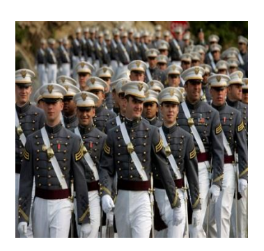
U.S. Military Academy West Point, New York