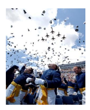
U.S. Air Force Academy Colorado Springs, Colorado