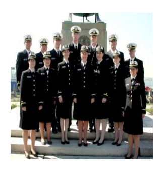
U.S. Merchant Marine Academy Kings Point, New York