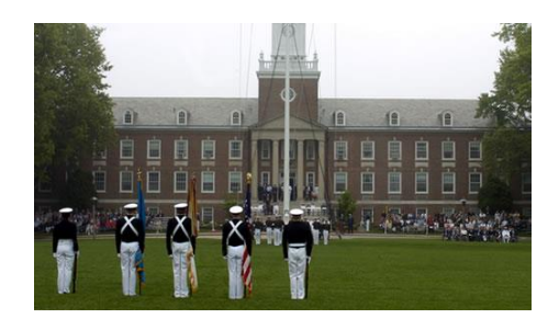
U.S. Coast Guard Academy New London, Connecticut