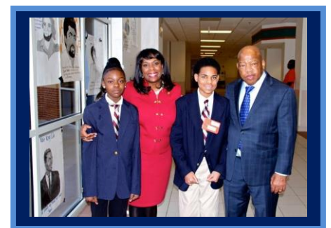
Congresswoman Sewell with Congressman John Lewis and students of Bellingrath Middle School