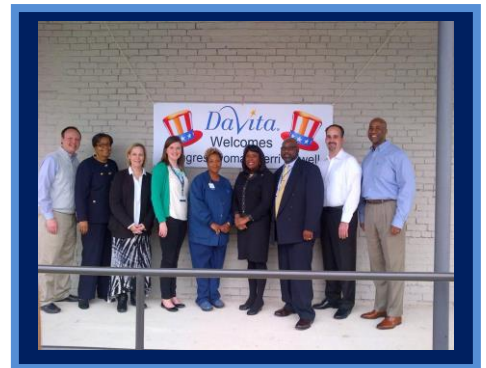
Congresswoman Sewell with the staff of Davita Dialysis on February 17 th