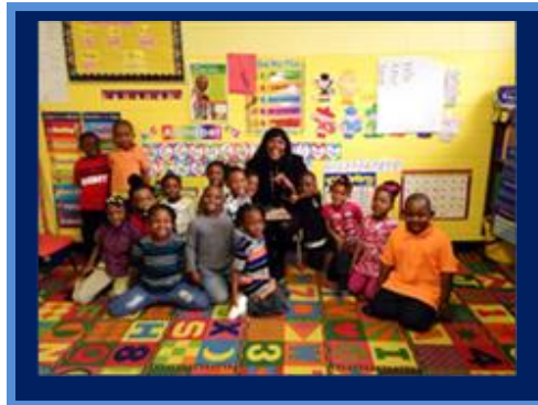
Congresswoman Sewell visits with students at Berean Baptist Head Start in Marion on February 20 th