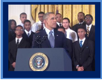
President Obama speaks before signing the Presidential Memorandum

On February 27, Congresswoman Sewell joined President Obama at the White House in the announcement of “My Brother’s Keeper” – a new initiative aimed at empowering boys and young men of color. We are pleased that the Obama Administration is instituting a proactive initiative to reduce the troubling trends facing black boys and young men.