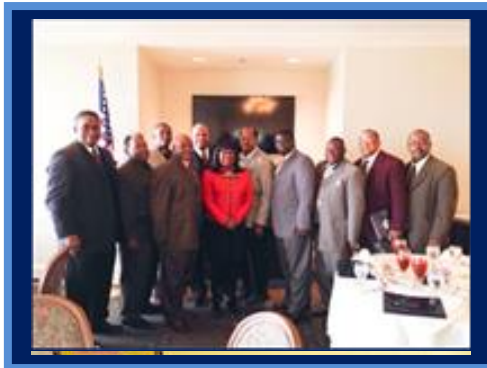
On February 19 th , Congresswoman Sewell joins the Montgomery Ministerial Alliance to provide a legislative update