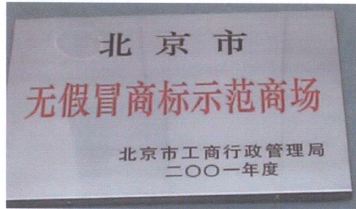
Beijing Administration for Industry and Commerce Sign: "Model Market for No Counterfeit Trademarks, 2001"

Science and Civilization in China. Looking to the future, China has indeed committed significant resources to revamping its laws, establishing a specialized IP court system, implementing specialized administrative agencies with power to fine infringers, and enacting and publicizing laws or measures that may extend beyond TRIPS minima.