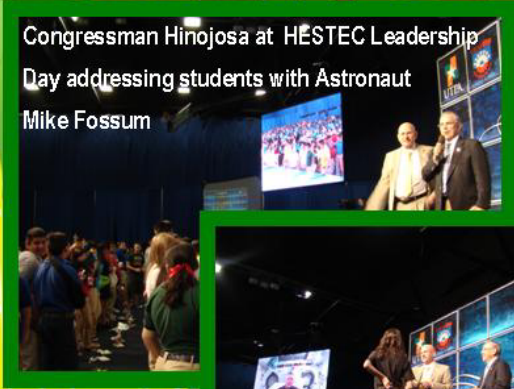
Congressman Hinojosa at HESTEC Leadership Day addressing students with Astronaut Mike Fossum