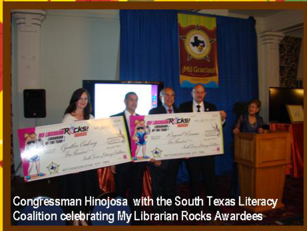
Congressman Hinojosa with the South Texas Literacy Coalition celebrating My Librarian Rocks Awardees