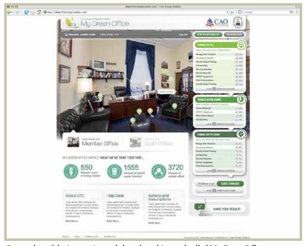
Screen shot of the interactive, web-based tracking tool called My Green Office.

To help support offices that want to "go green," GTC also developed an interactive, web-based tracking tool called My Green Office. More than 100 CAO and Architect of the Capitol (AOC) employees, including office coordinators and technical support representatives (TSRs), were trained in the new system and became experts in sustainable business practices. For several months, CAO staff used the tool to help introduce House employees to sustainable product choices, energy efficient behavior and resource-conservation efforts.