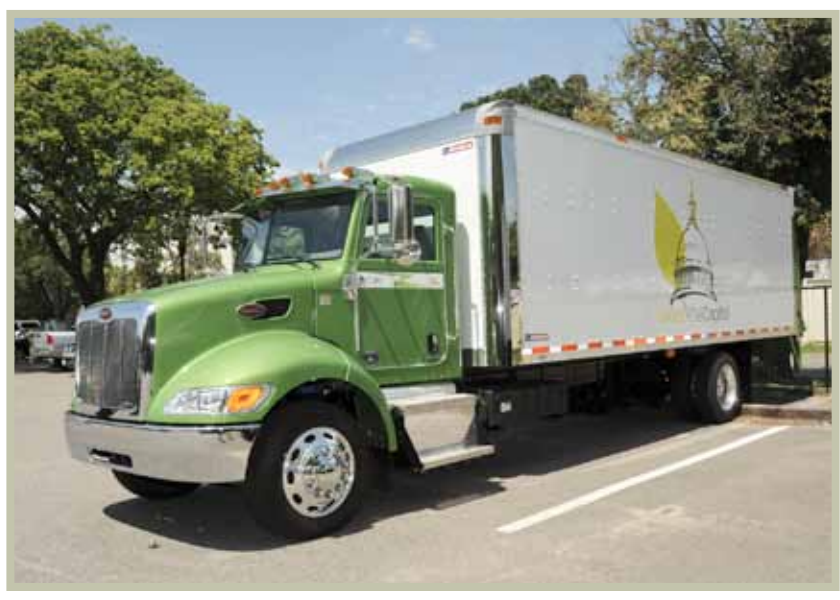
CAO's hybrid Peterbilt truck.

All of these activities reduce the environmental footprint of the House, improve indoor air quality for Members and staff and reduce operating costs.