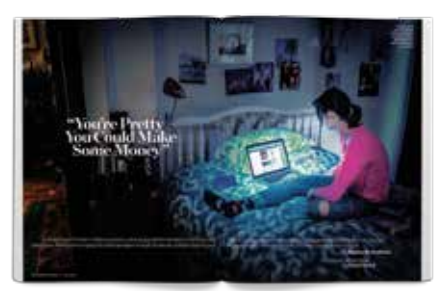
CONTINUED FROM PAGE 77

when asked how many girls he had sold, Strom answered: "Too many to count."