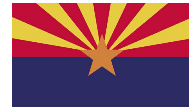
I am confident that the U.S. Supreme Court will uphold Arizona's rights to protect its citizens and law enforcement officers

Arizona Must Do What the Federal Government Refuses to Do