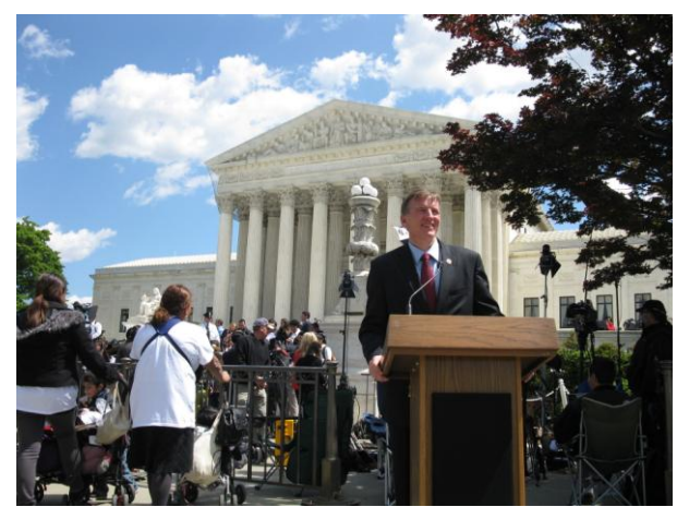
We are still waiting for the Obamacare and S.B. 1070 Supreme Court decisions

The Upcoming Supreme Court Decisions: Protecting Worker Choice and Patiently Waiting for Obamacare and Arizona Immigration