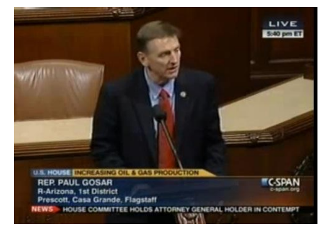
Video: Dicussing the Domestic Energy and Jobs Act on the

On Thursday, I voted in favor of the Domestic Energy and Jobs Act (H.R. 4480), which included seven bills that would address the high energy costs hurting American families by investing in domestic energy, and creating thousands of jobs.