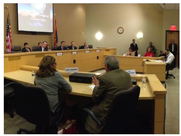
(Witnesses testify about how ObamaCare has hurt them, December 6, 2013)

repealed and most importantly...REPLACED.