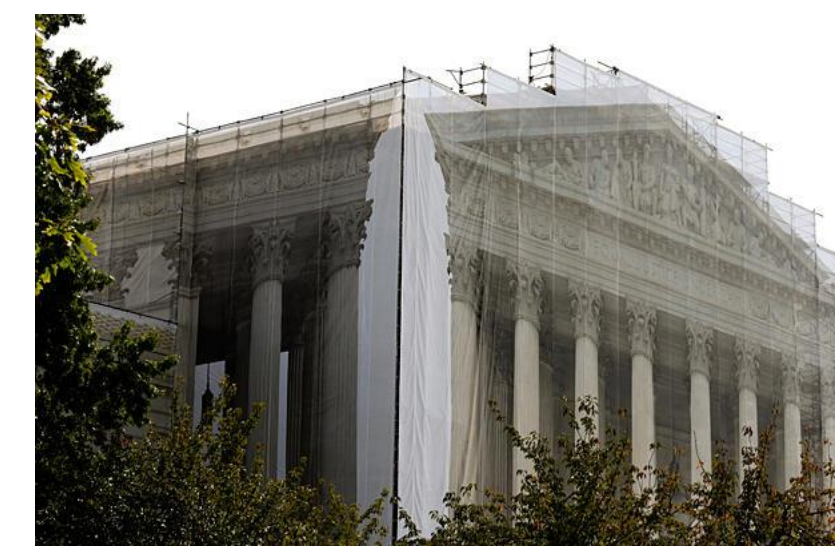
(The Supreme Court covered by a scrim on which a full-size photograph was printed to hide scaffolding)

The language in my third <u>letter</u> would prohibit the Department of Veterans Affairs (VA) from giving bonuses to its senior executives. As of December 2013, almost 400,000 veterans were still trapped in the VA's backlog of claims older than 125 days. Some have been waiting to get their claims processed for years. Even though the VA has failed to process claims in a timely manner, senior executives have continued to receive bonuses. The VA should focus their efforts on services for our veterans and reducing the backlog, not rewarding under-performing bureaucrats.