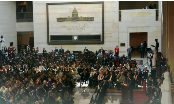
(Emancipation Hall in the Capitol Visitors Center is packed for the ceremony, November 20, 2013)

On Wednesday, I attended the Congressional Gold Medal ceremony in honor of Native American Code Talkers. These Native Americans transmitted code based on 33 tribal dialects during combat operations in World War I and II. I am humbled by their courage and sacrifice, especially to a nation that did not always allow them the same rights for which they fought. It was an honor to attend the ceremony.