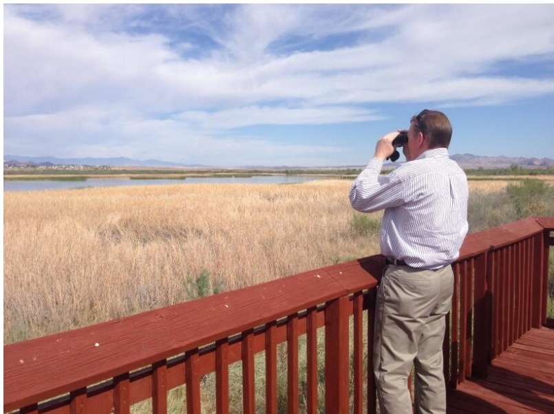
(Rep. Gosar checking for Egrets at the Beal Tower Havasu National Wildlife