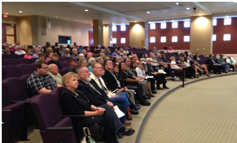
(Great turnout at the field hearing, April 14, 2014)

I held a field hearing in Kingman on Monday about the Downwinders of Mohave County. I was moved by the emotional stories I heard of the trauma and illnesses they suffered. It breaks my heart that they've been victimized twice by the federal government: first when the federal government exposed them to radiation from nuclear testing and again when they were excluded from benefit eligibility.