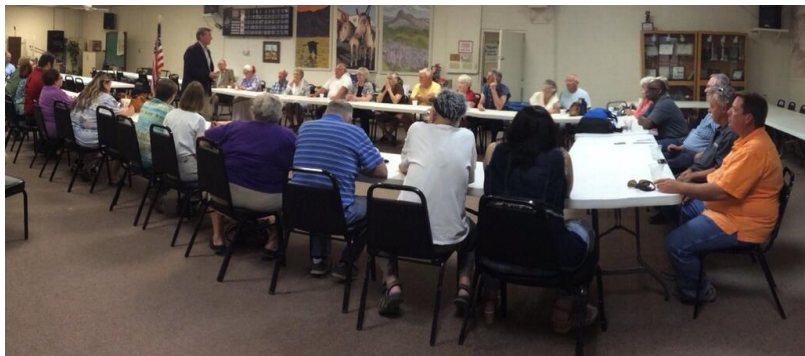
(Rep. Gosar at a Tax Day town hall in Topock, April 15, 2014)