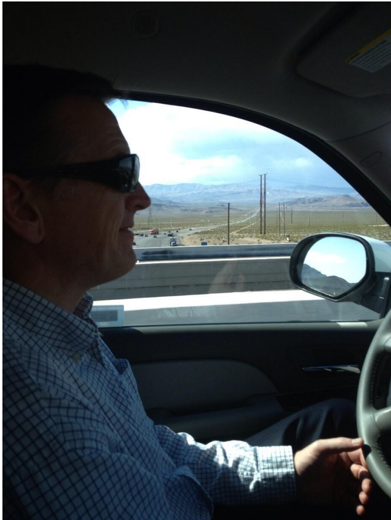
(Rep. Gosar driving to the Bundy family ranch, April 12, 2014)

the Bureau of Land Management (BLM) and the Bundy family. While I was pleased that the BLM decided to end the roundup, that does not change the fact that the way they handled this situation is unacceptable.