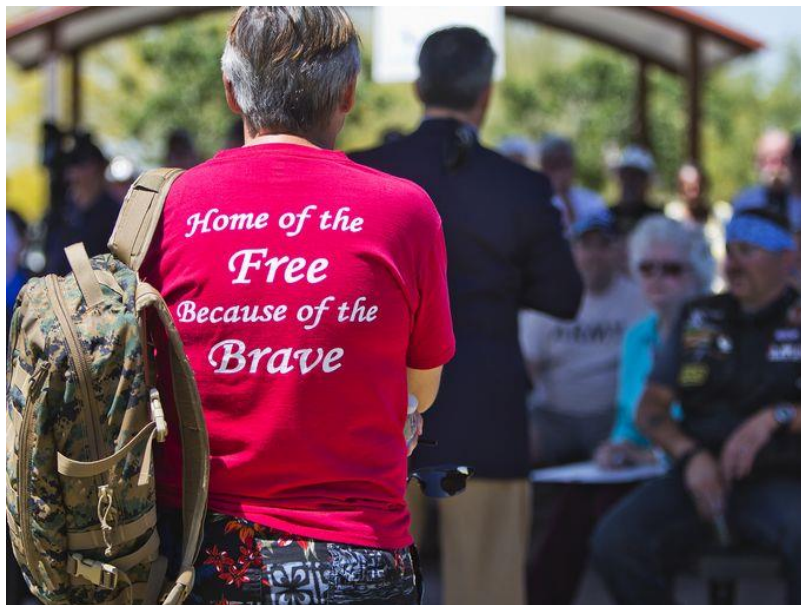
(A picture from the rally, April 16, 2014)

In my last e-newsletter, I told you about a report that up to 40 veterans had died as a result of delays at the Phoenix VA and that, allegedly, VA workers kept two sets of records in order to conceal ridiculously long wait times. Concerned Veterans for America held a rally in Phoenix on Wednesday to bring attention to mismanagement at the Phoenix VA and the need for reform. Unfortunately, I wasn't able to attend the rally, but I sent my Wounded Warrior Liaison to read my statement, the entirety of which you can read by clicking HERE .