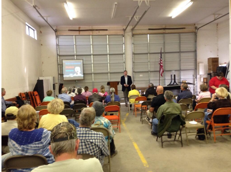
(Rep. Gosar making a presentation at a town hall in Paulden, April 12, 2014)