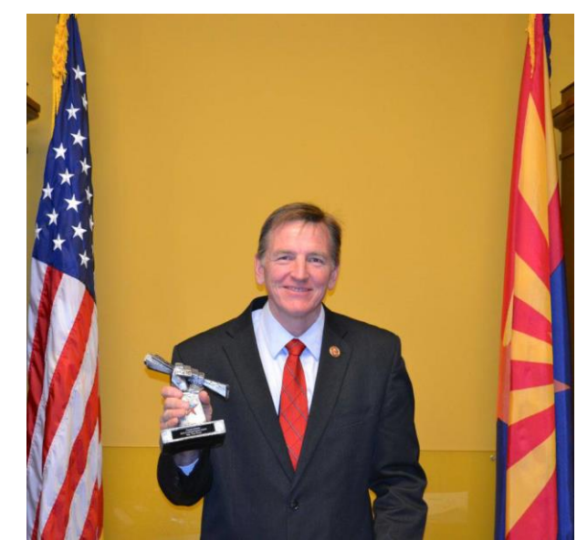
(Rep. Gosar poses for a photo holding the FreedomFighter Award, August 1, 2013)

I was honored to receive the FreedomWorks "FreedomFighter Award". The freemarket system is the greatest engine for prosperity and opportunity. I will continue to defend and promote economic freedom.