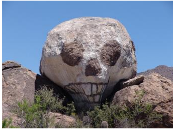
(Skull Rock, Hillside, Arizona)

Date Creek Road, which connects Congress with the ghost town of Hillside, has an odd, skull-shaped boulder, which is whitewashed. Fittingly, it is called Skull Rock.