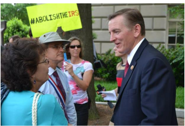
(Rep. Gosar talks to protesters at a rally against IRS abuse outside the agency's headquarters)

Not only should the indefensible targeting of Americans for their political beliefs be made illegal, it should be a fireable offense. When bureaucrats abuse their power, waste taxpayer dollars and betray the rule of law, they should face the penalty. The STOP IRS Act is essential to delivering the accountability, honesty and integrity the American people deserve from government.