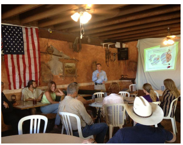
(Rep. Gosar takes questions at his business roundtable, May 10, 2013)

Yesterday, I hosted a Business Roundtable in Black Canyon City. Many local business owners expressed their frustrations with out-of-control government spending and regulations.