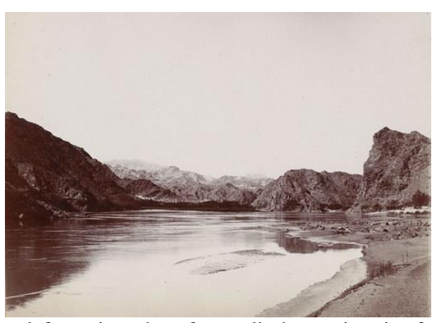
(Bull's Head rock formation)

Although most of the formation is now submerged in Lake Mohave, Bullhead City's name comes from a rock formation resembling a "Bull's Head".