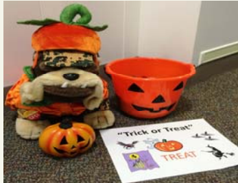
USMC Chesty getting into the spirit! Trick or Treat, give to CFC?!