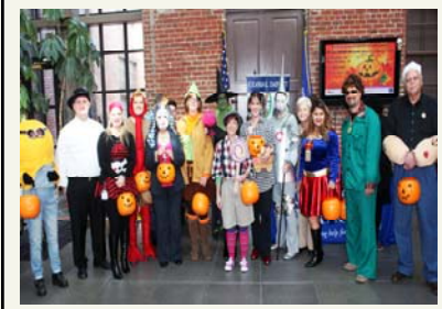
NAVFAC employees raising awareness and having a little fun while doing so! The CFC Costume Contest raised over $900 in I hour!!! Go NAVFAC!