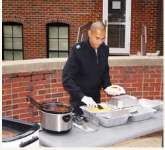
MSC CFC Breakfast Burrito Fundraiser. Thank you to our volunteers who give heart and soul to campaign efforts!