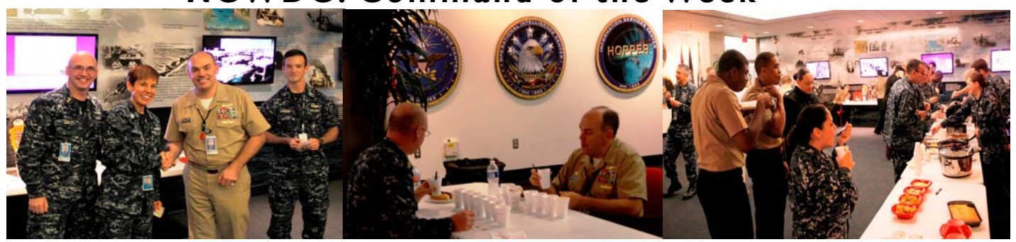
Tasty philanthropic fun at the Chili Cookoff, Friday, 24 October 2014, at the Naval Cyber Warfare Development Group (NCWDG), Hoyer Foyer at the Suitland Federal Center.