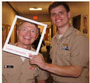
Military Sealift Command (MSC) leadership rallying the troops and participating in CFC command fundraiser.