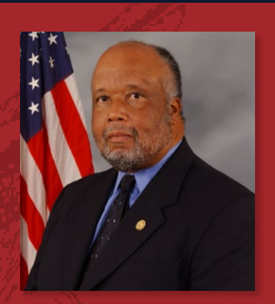
COMMITTEE ON HOMELAND SECURITY Bennie Thompson of Mississippi