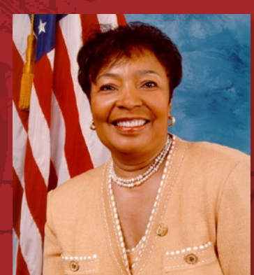
COMMITTEE ON SCIENCE, SPACE & TECHNOLOGY Eddie Bernice Johnson of Texas