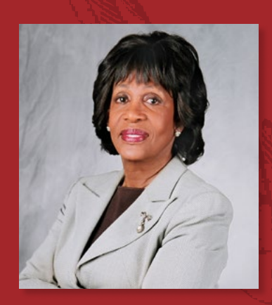
COMMITTEE ON FINANCIAL SERVICES Maxine Waters of California