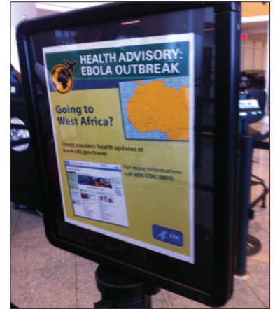
Health advisory for airline travelers