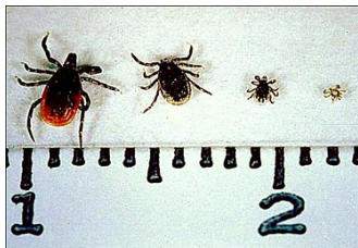
Size of Black-Legged (Deer) Ticks on Ruler (from left: adult female, adult male, nymph, larva)

The life cycle of these ticks is approximately two years, going through the stages of egg, larva, nymph and adult. Nymph and adult black-legged ticks feed on humans. The pinhead sized nymphs are the most dangerous, because of the difficulty finding the ticks before they can transmit infection.