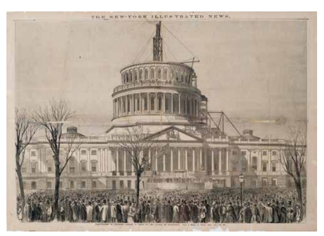
"Inauguration of President Lincoln in Front of the Capitol at Washington," 1861 Lincoln's first inauguration was also the first held beneath the cast-iron Dome under construction.

Independence Day Fireworks, 2002 The nation's Independence Day celebration at the Capitol and on the National Mall ends with fireworks that light up the Dome and the Washington Monument.