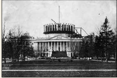
DECEMBER 31, 1857

The First Dome, 1825–1856 In the 1820s President James Monroe directed architect Charles Bulfinch to make the copper-covered wood-and-masonry Dome higher than first planned.