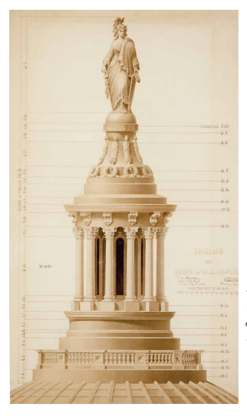
Thomas U. Walter, "Tholus on Dome of U.S. Capitol," 1863.

Her right hand rests upon the hilt of a sheathed sword wrapped in a scarf; in her left hand she holds