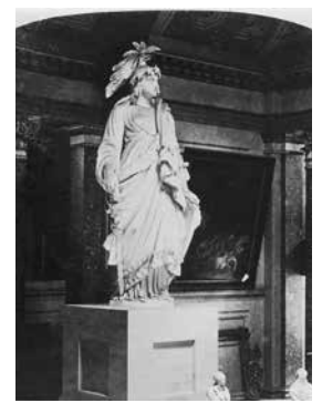
The plaster model for the Statue of Freedom displayed in National Statuary Hall after casting was completed.

After the sculptor's sudden death, his widow had the model packed into six large crates, including one for the smaller elements, and had them shipped from Italy in 1858. After numerous problems and delays, all of the crates finally reached Washington by late March 1859.