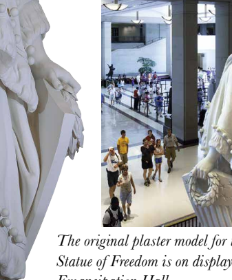
The original plaster model for the Statue of Freedom is on display in Emancipation Hall.

transported to his foundry in 1860. After the casting was completed, it was reassembled and displayed in the Hall. In 1890 it was transferred to the Smithsonian Institution, where it was exhibited for 75 years in the Arts and Industries Building and then taken apart and stored for 25 years. In 1992, it was moved to and restored for display in the Russell Senate Office Building basement rotunda. It was once more moved and restored as the centerpiece of Emancipation Hall when the Capitol Visitor Center opened in 2008.