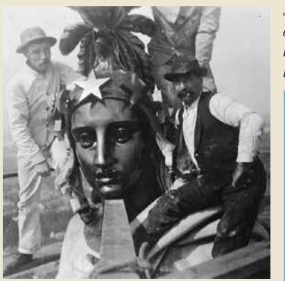
Workmen pose for a photograph after cleaning the statue in 1913. For many years, the statue was cleaned each time the Capitol Dome was painted.

Since 1993, a specially designed scaffold is used for the regular maintenance of the statue. (below)