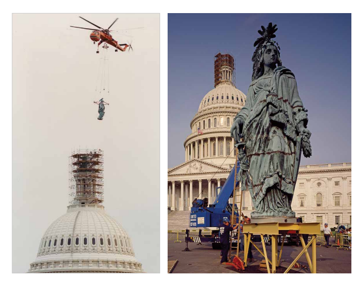
The bronze statue was removed by helicopter to the East Front plaza for restoration in 1993. Surface corrosion and discoloration of caulk in the seams were the most visible signs of its exposure to the elements for over a century.

Since then, its protective coating has been renewed every few years to prevent corrosion, keeping it in good condition.