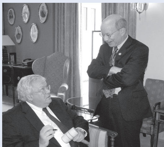
House Speaker Dennis Hastert honored Congressman DeFazio with the presentation of a signed gavel used during the consideration of SAFETEA-LU.

What's best is that all this work will be done without borrowing and adding to the deficit. Unlike most federal legislation, SAFETEA-LU will not increase the U.S. deficit because it is paid for through the Highway Trust Fund, which is sustained with gas tax receipts.