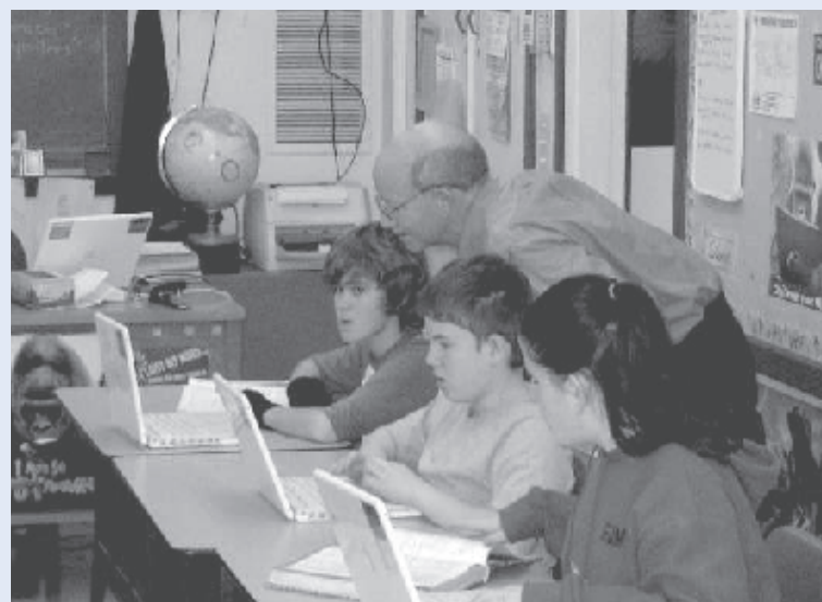
Springfield Middle School students showed Congressman DeFazio their new classroom laptops, which were partially funded through Title I. The President has proposed freezing funding for this important program.

We need budget policies that give our kids a shot at the American Dream.