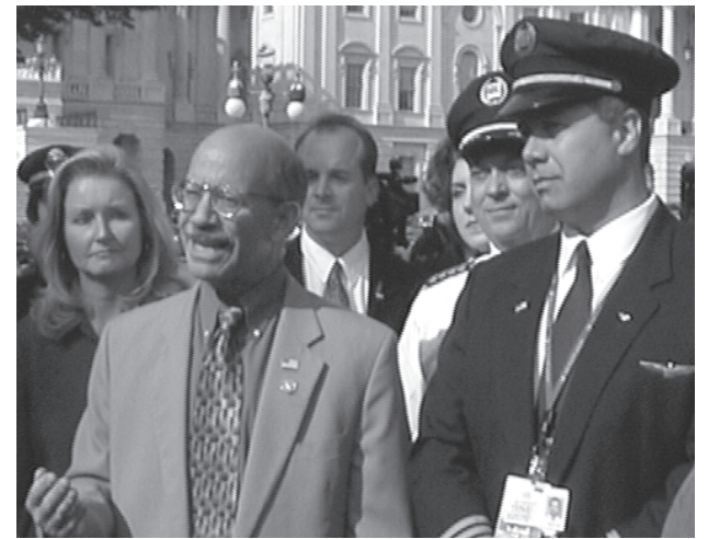
Rep. DeFazio is joined by pilots and flight attendants at an event in front of the U.S. Capitol to call for immediate federalization of airport security.

I was one of a small group of House and Senate members appointed to the conference committee on aviation security which was responsible for working out the differences between the House and Senate bills. Agreement was quickly reached on a majority of the security provisions in the bill including securing cockpit doors, increasing the number of Air Marshals, screening all individuals who have runway and aircraft access and improving screening technology. The status of airport screeners, however, remained a sticking-point. After intense negotiations, the conferees agreed to have the federal government