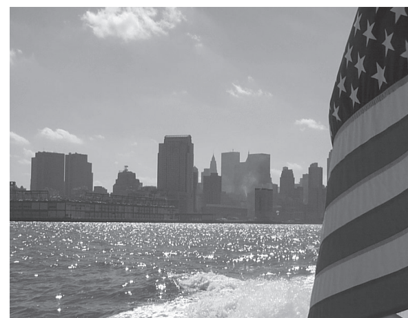
Although the terrorist attacks September 11 changed the world forever, my visit to Ground Zero highlighted the unique strength and resilient spirit of America.

Our nation has had many proud moments since the craven terrorist attacks on September 11. The extraordinary valor shown by police officers, firefighters, and emergency services workers has inspired us all. The rapid response, sacrifice, and service of the National Guard, Coast Guard, and active duty military personnel to ensure our national security is comforting. It has also been heartening to witness the generosity of average Americans who have donated blood and money, volunteered time, and helped in any way possible. Despite the shock and uncertainty since the terror attacks, America has drawn strength from a renewed sense of unity and national purpose.