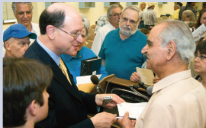
Congressman Sherman has held over 100 Town Hall Meetings. Here, he discusses health care with Valley residents at the conclusion of his Town Hall last summer.

Congressman Brad Sherman 5000 Van Nuys Blvd., Suite 420 Sherman Oaks, CA 91403 Phone: (818) 501-9200 Fax: (818) 501-1554