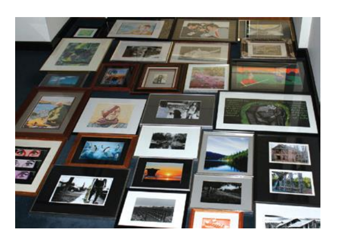
Over two dozen entries were submitted