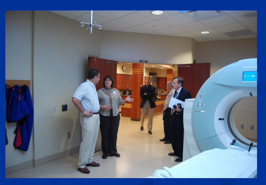
Allen Hospital, Waterloo