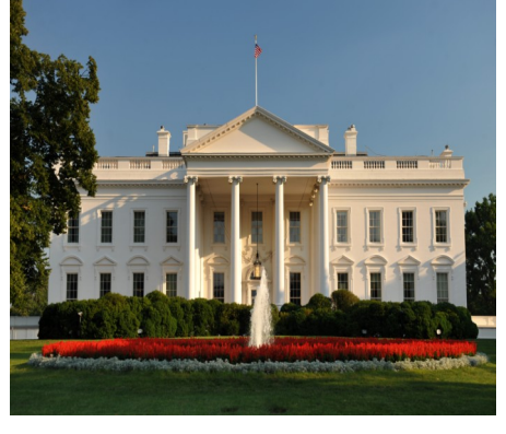
The White House 1600 Pennsylvania Ave., NW