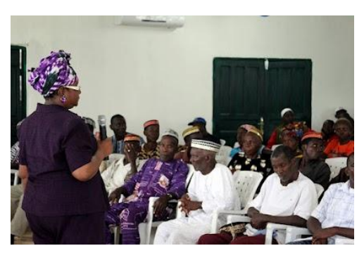
Rep. Gwen Moore address the town hall meeting in Klay, Liberia during the delegation's visit

delegation to discuss constituent relations. The delegation also met with Liberian President Ellen