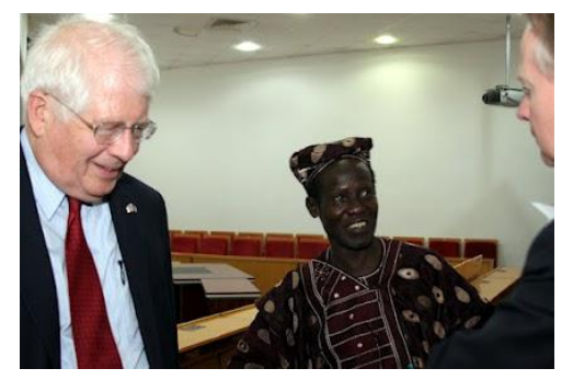
Reps. Price and Dreier visit with the Speaker of the South Sudanese National Legislative Assembly

the Speaker of the NLA, James Wani Igga, who emphasized the longstanding relationship between the U.S. and South Sudan and highlighted the need for more capacity building for the Members and the staff of the NLA. The Deputy Speaker of the Council of States (the upper House of South Sudan's legislature), Remy Oller Itorong, also attended the meeting along with many committee chairs from both bodies. Concurrently, U.S. congressional staff met with Southern Sudanese legislative staff to answer questions and assess the current capacity of the legislative staff.