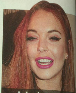
Lohan's minibar bill was $3,145.07!

"Chris will support her any way he can," a source close to Rock tells Us .