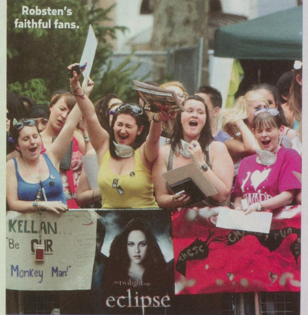
Robsten's faithful fans.

During Comic-Con in San Diego, it looks like business — and love — as usual. Says a witness, "He seemed so smitten with her, staring and smiling."