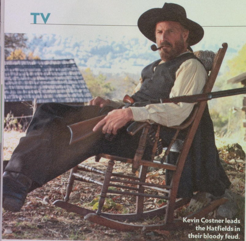
Kevin Costner leads the Hatfields in their bloody feud.