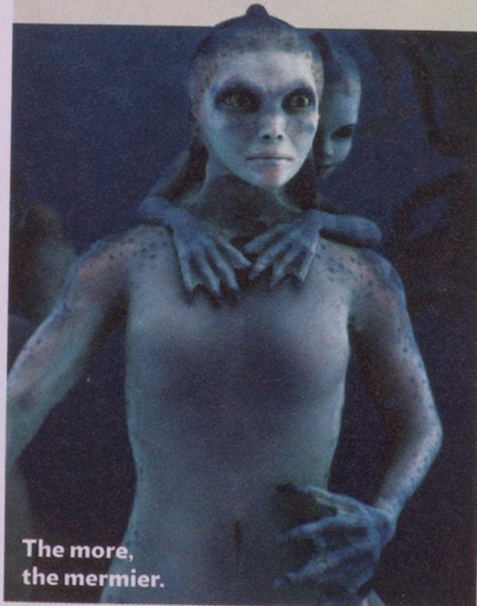
The more, the merrier.

Mermaids: The Body Found (Animal Planet, May 27) is a silly faux-documentary accusing the government of suppressing the ocean's merpersons. (We should be politically correct.) The idea that our evolutionary tree split into land- and sea-dwelling species is intriguing, but the cheesy CGI creatures swish about like Cirque du Soleil performers with tails. ★★★★★