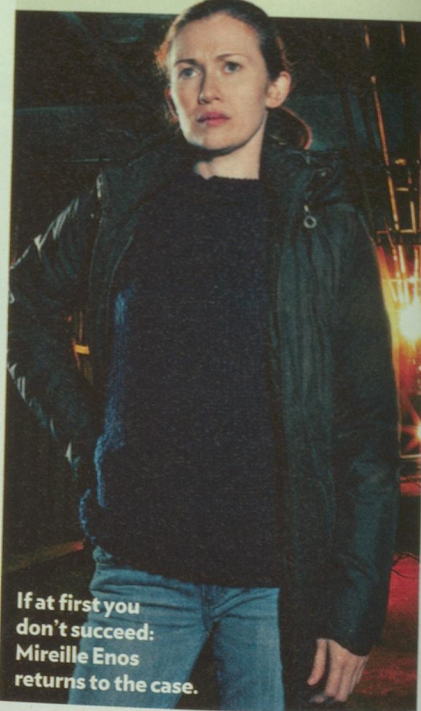
If at first you don't succeed: Mireille Enos returns to the case.

AMC's The Killing infuriated audiences with the revelation in last season's finale that... well... Rosie Larsen's murderer probably hadn't been identified. Season 2 (premiering April 1) finds detective Sarah Linden (the superbly dour Mireille Enos) back on the case. It's very well-done, but the opener doesn't resolve a viewer's doubts: If the first go-round was a red herring, how do we know this time we're not being fed baloney? ★★★★★