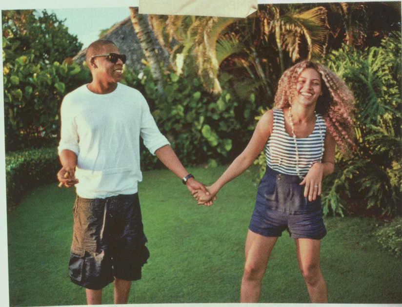
This spring, Beyoncé created a Tumblr filled with personal pics—and that was the end of anyone getting anything done.