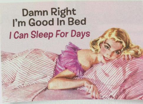
Heh—get it? Get it? Posted on Pinterest by Alex Ahlgren; created by Ephemera.