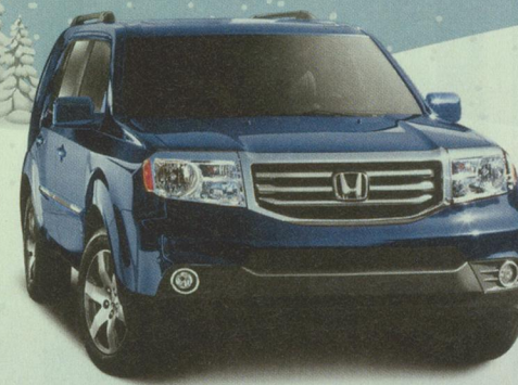
| 2013 Pilot |