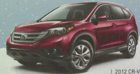
| 2012 CR-V |