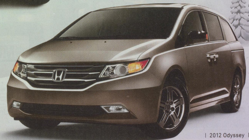
| 2012 Odyssey |

THE DEAL OF A LIFETIME ONLY COMES ONCE A YEAR.