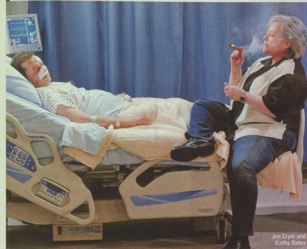
Jon Cryer and Kathy Bates