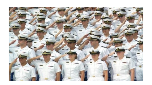
U.S. Naval Academy Annapolis, Maryland

The deadline for submitting an application for consideration for a nomination through U.S. Representative Murphy's office is September 12, 2014