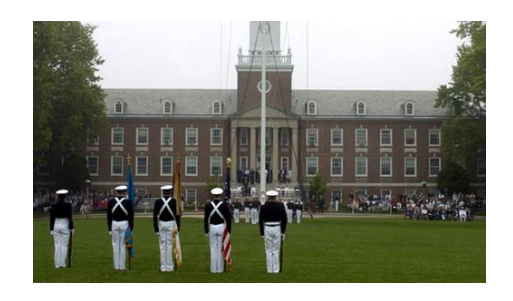
U.S. Coast Guard Academy New London, Connecticut