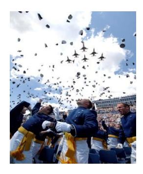
U.S. Air Force Academy Colorado Springs, Colorado