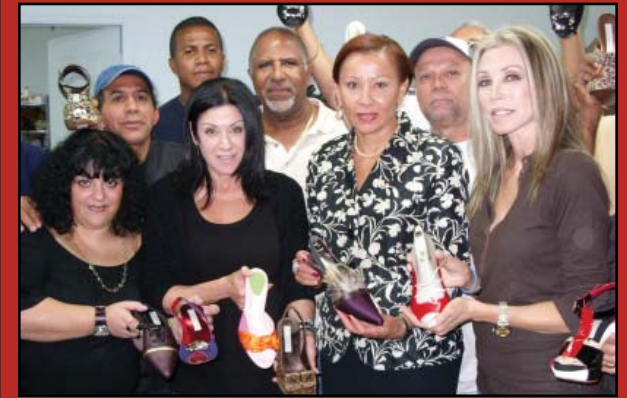
Congresswoman Velázquez visits the Brooklyn factory where Olivia Rose Tal Shoes are crafted. The locally owned and operated small business is one of only a few shoe manufacturing companies in the United States.

"Access to credit is critical, and we have taken the first steps needed