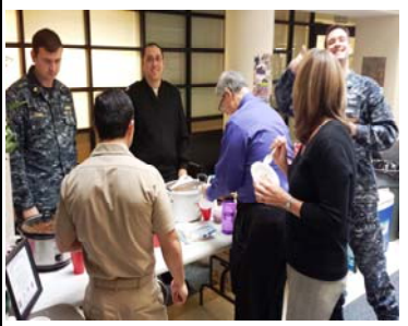
CNIC Chili Cook-off participants warming up from the chill outside, clamoring for a tasting and secret recipes.